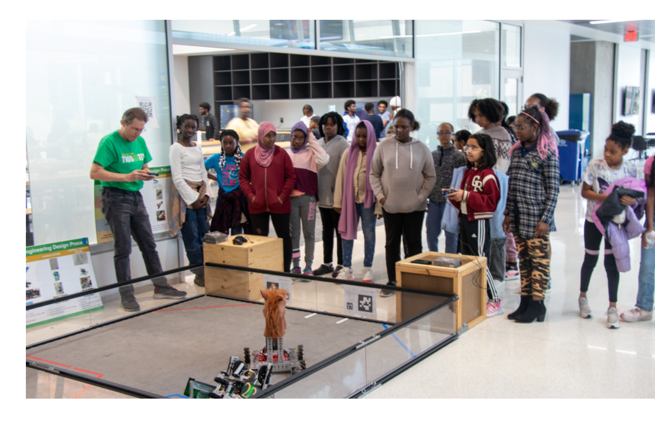
Black Girls Do Science