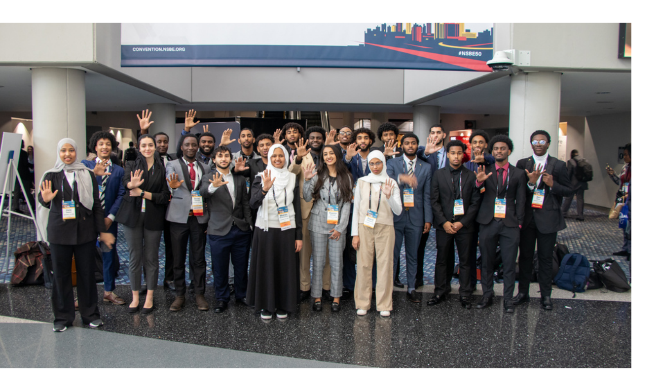
NSBE Nationals Convention