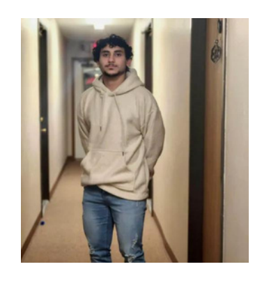
Senator Bahaa Mohammad