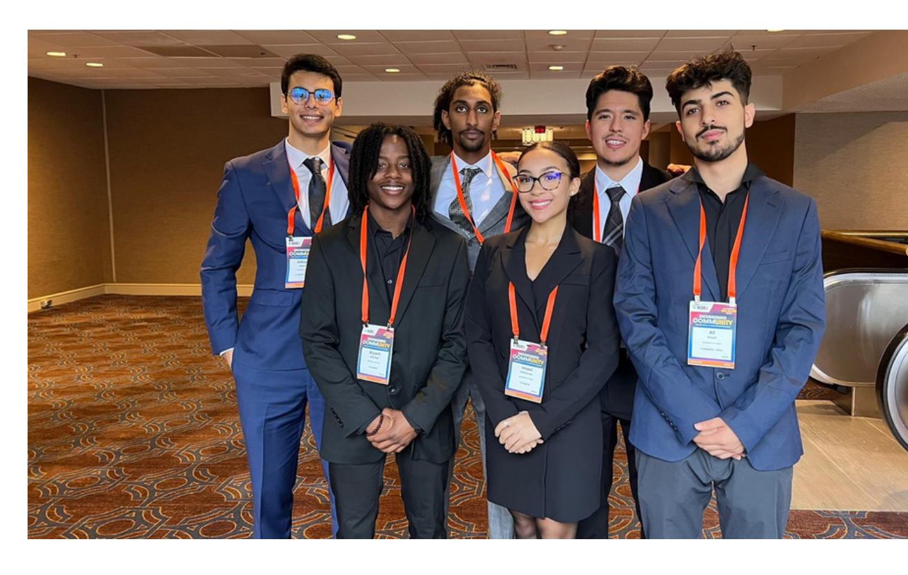
Fall Regional Conference